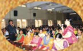
Workshop for parents