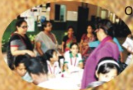
Thyroid awareness camp