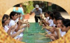
Piping a tune