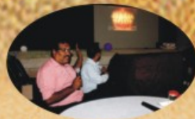
Oral hygiene -awareness drive

We can make the change- We'll find a way.