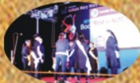
One Billion Rising