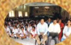
Talk on Cyber crime by Kolkata Police