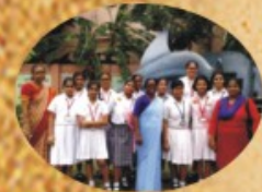
Visit to St. Vincent, Thakurpukur