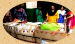
Recycling of old newspaper