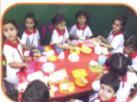
Little Chefs: Bon Appetit