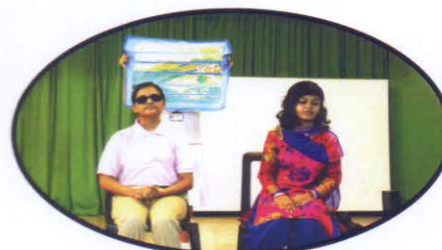
World Anglo Indian Day