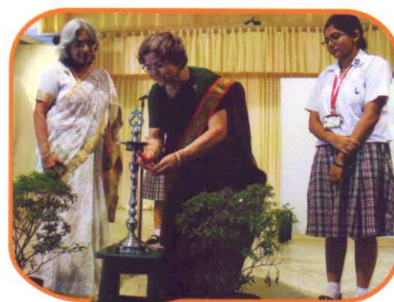
Teachers' Day: Lighters of the lamp and keepers of the faith