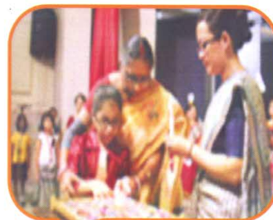
Children's Day: You are child of the Universe