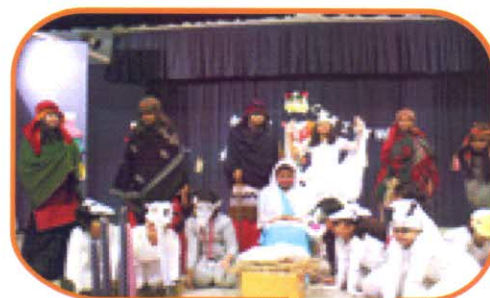
Nativity Play : Joy to the World