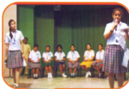
Inter House Debate Competition : Words, words, words...