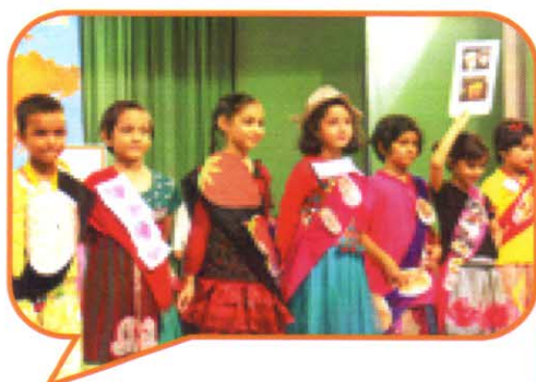
Walk With Grace : Students of Junior School depict the dress, culture and traditions of the nations that participated in the FIFA World Cup 2014