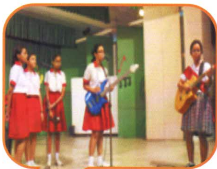
World Music Day: "If music be the food of love, play on." -Shakespeare