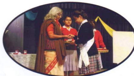
Farewell to Student Council