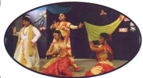
Farewell to Class XII