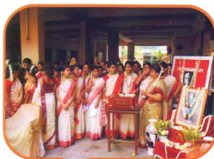
Rabindra Jayanti : Paying homage to the Bard of Bengal