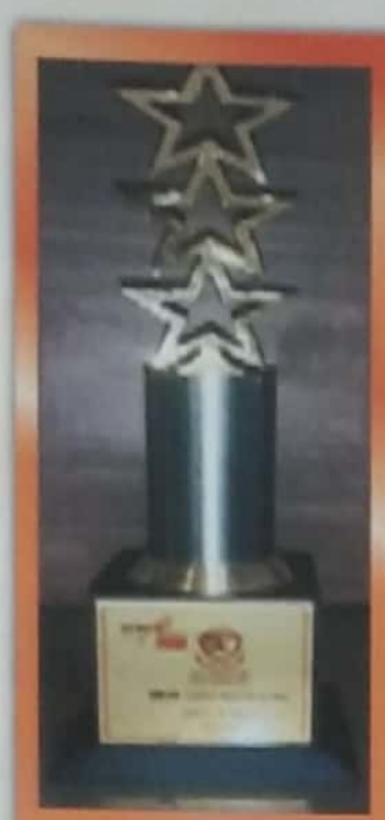
Best school award in ISC Hindi