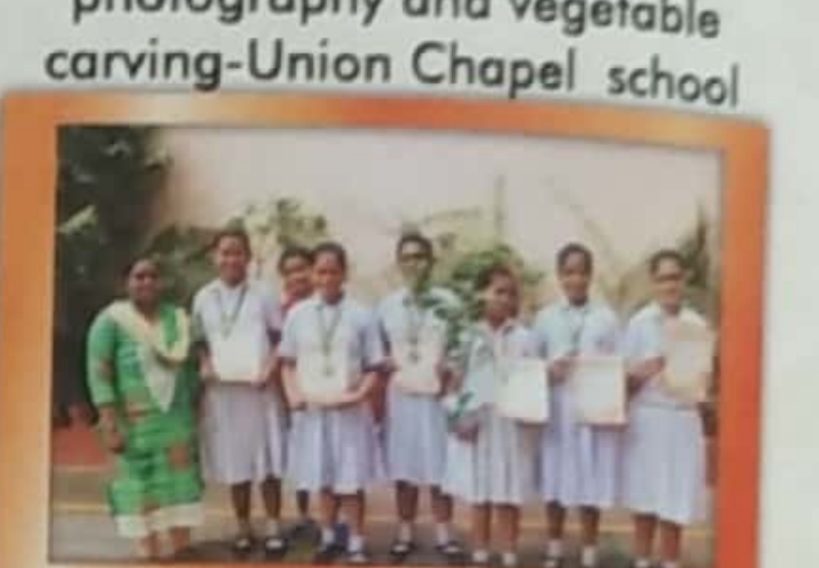
2 nd and 3 rd position in photography and vegetable carving-Union Chapel school