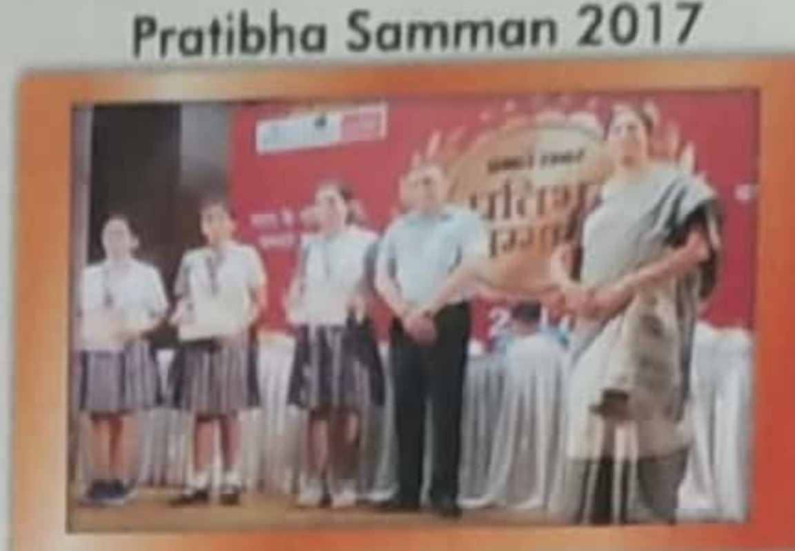
Pratibha Samman 2017