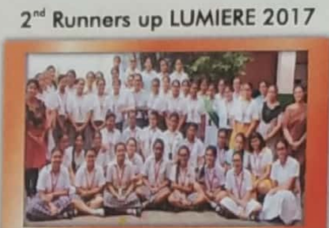
2 nd Runners up LUMIERE 2017