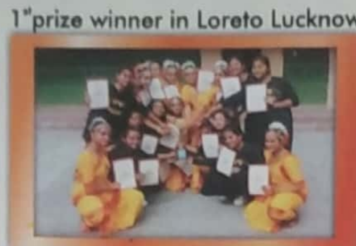
1 st prize winner in Loreto Lucknow