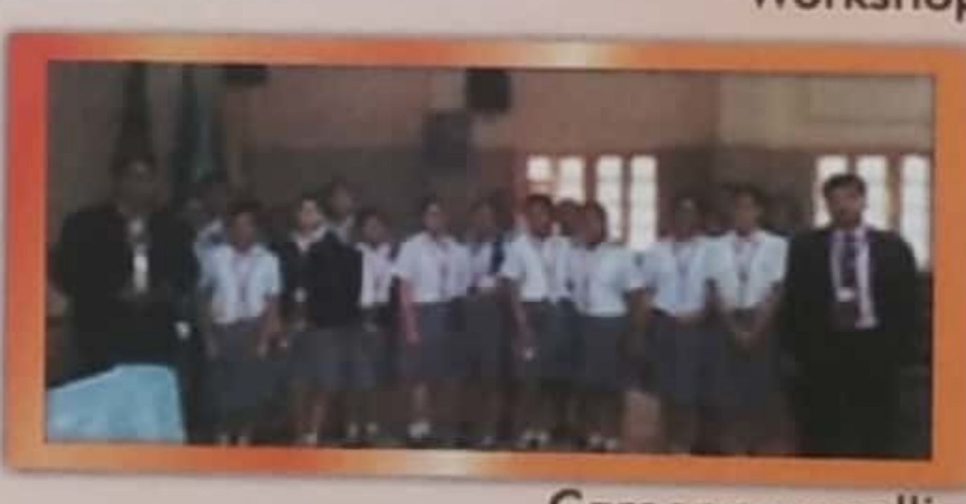
Career counselling for senior classes