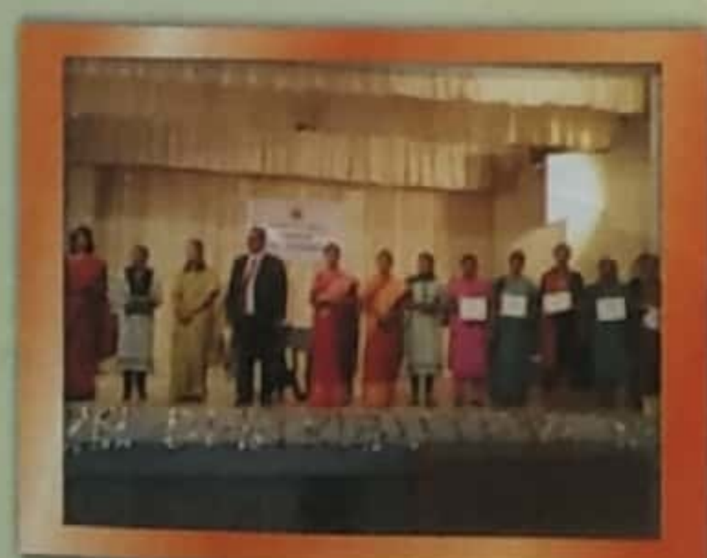
FELICITATIONS Annual prize distribution