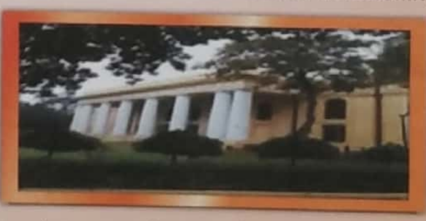
A tour to the city of Kolkata by the students of History department, class 11