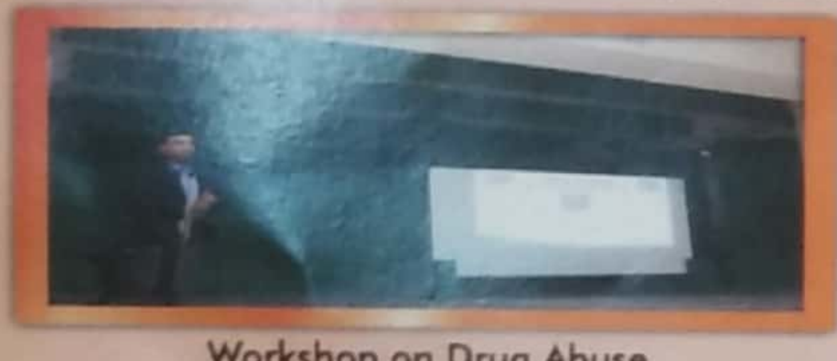
Workshop on Drug Abuse