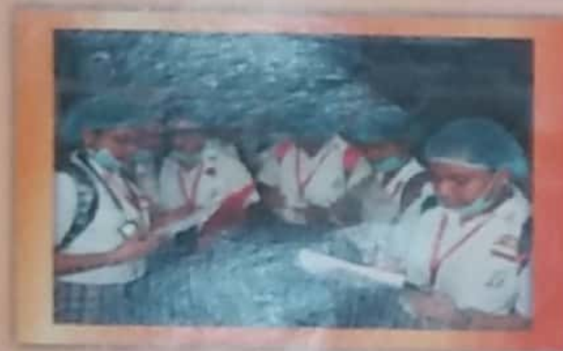
Educational tour to Raja Biscuit Factory by students of class 12

To acquire knowledge, one must study; but to acquire wisdom, one must observe.....Eleanor Roosevelt