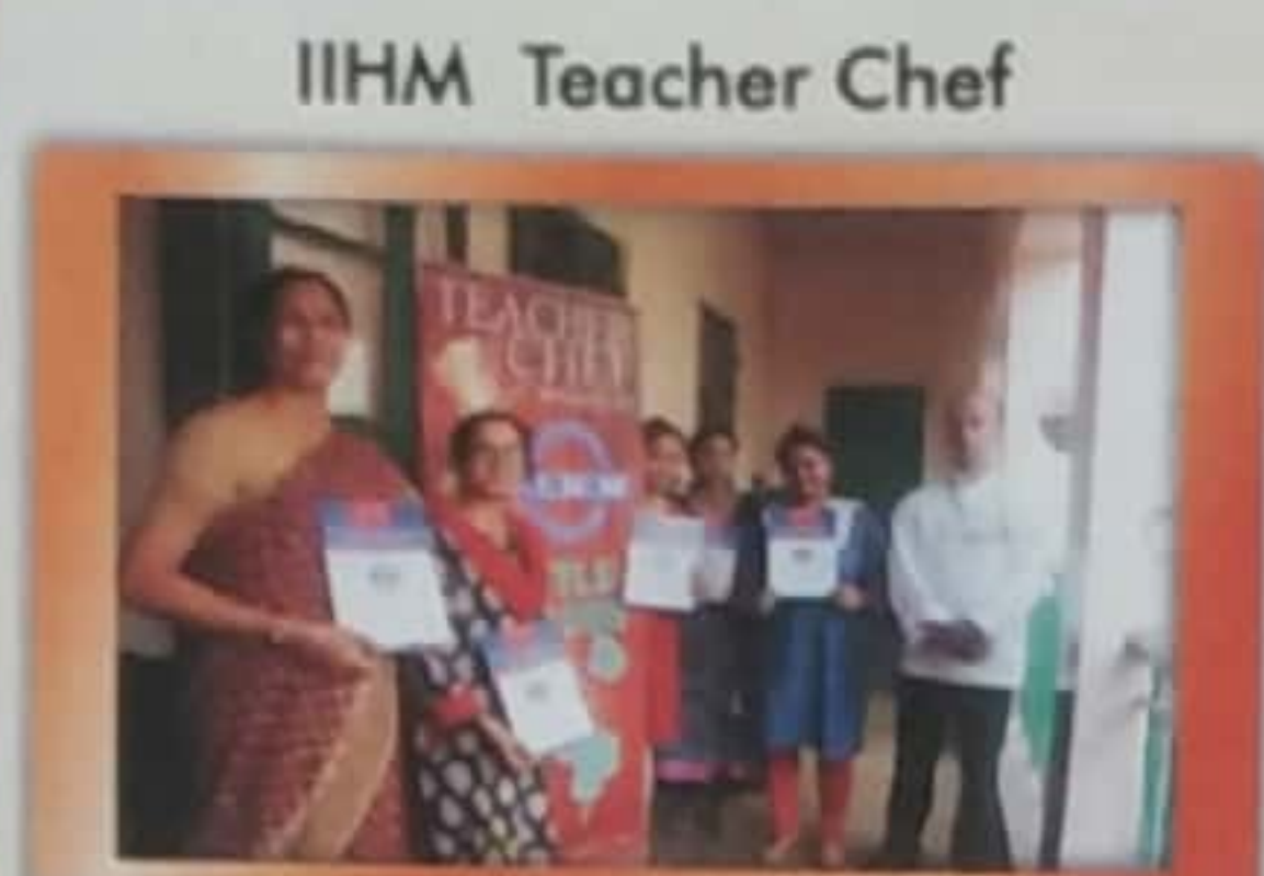
IIHM Teacher Chef